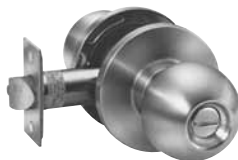
PRIVACY RESTROOM INSIDE TURN BUTTON