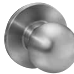
DUMMY BALL KNOB