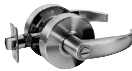
PRIVACY RESTROOM INSIDE TURN BUTTON