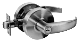
ENTRY ENTRANCE/OFFICE INSIDE TURN BUTTON