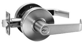
ENTRY ENTRANCE/OFFICE INSIDE TURN BUTTON