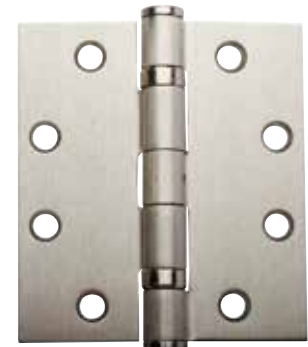
NON-REMOVABLE PIN BALL BEARING BUTT HINGE