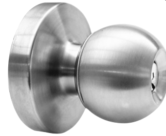
BALL KNOB TRIM

*ENTRY FUNCTION ALSO SERVES AS CLASSROOM FUNCTION